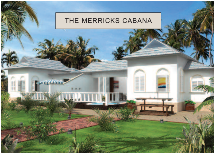
THE MERRICKS CABANA