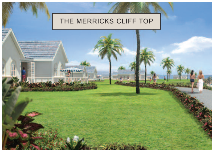
THE MERRICKS CLIFF TOP