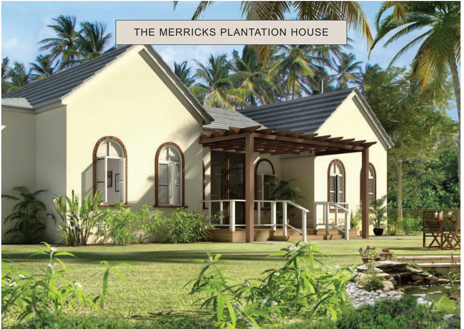
THE MERRICKS PLANTATION HOUSE