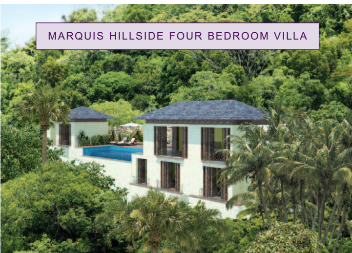
MARQUIS HILLSIDE FOUR BEDROOM VILLA