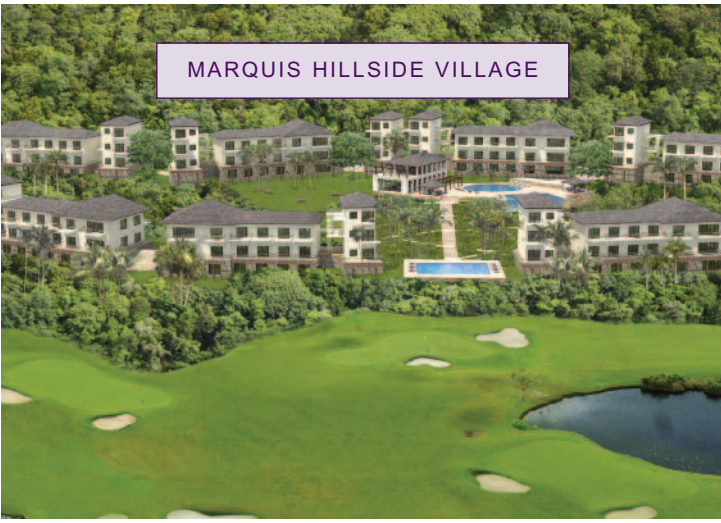
MARQUIS HILLSIDE VILLAGE