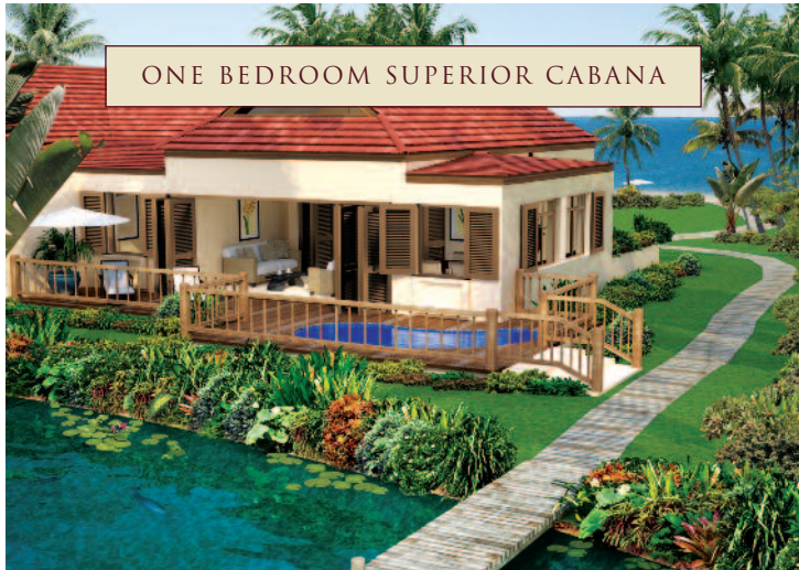
ONE BEDROOM SUPERIOR CABANA