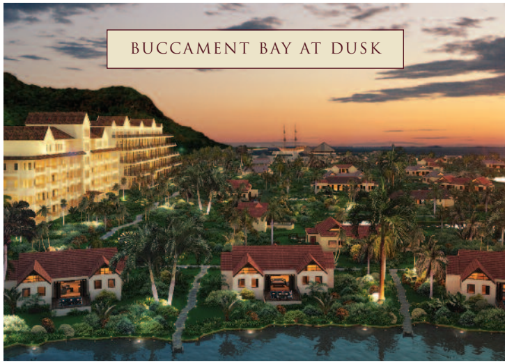
BUCCAMENT BAY AT DUSK